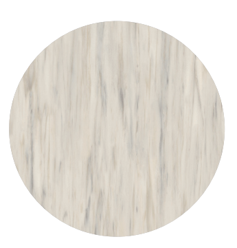
Dreamcatcher P1018 VL