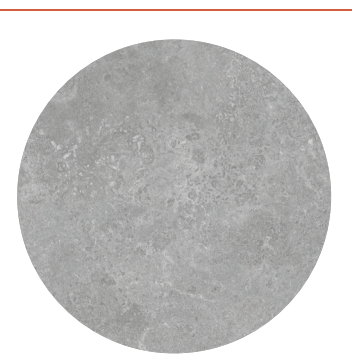
Cityscape Loft P1010 IM