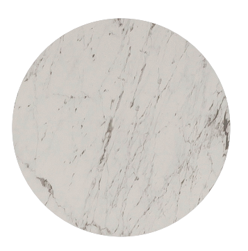
Carrara Venato P1015 UL