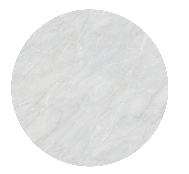
Mont Blanc P1009 VL