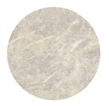
Versailles Marble P1016 UL