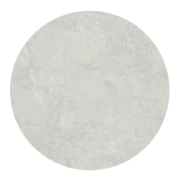
Monolith P407 VL

For samples and technical information: info@arborite.com